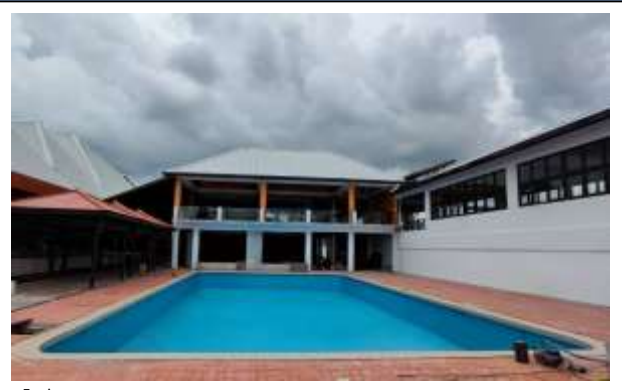
Swimming Pool Annexe